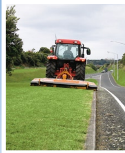
Rollers allow mowing along edges.

With downwing flotation, simple and infinitely variable height adjustment, full width striping, innovative new maintenance features and LazerBladez™, the StealthS2 will continue to set the standard for many years to come.