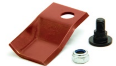
LazerBladez™ fling-tip blade, blade bolt and self-locking nut.