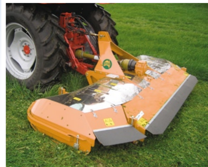
Handles infrequently mown long grass with ease.