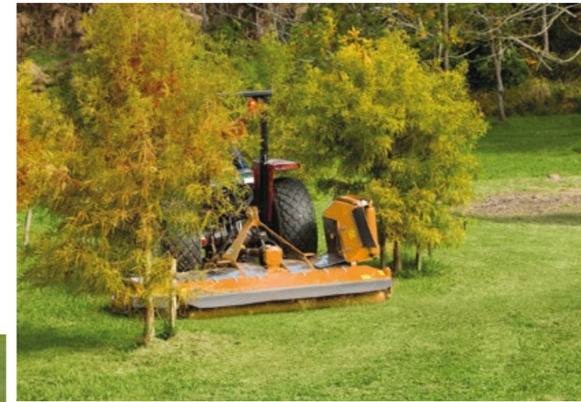
The StealthS2 can be operated with one or both wings raised, giving the added versatility of three cutting widths in one mower.

Full width rollers provide a brilliant full stripe effect for sports turf and golf courses alike.